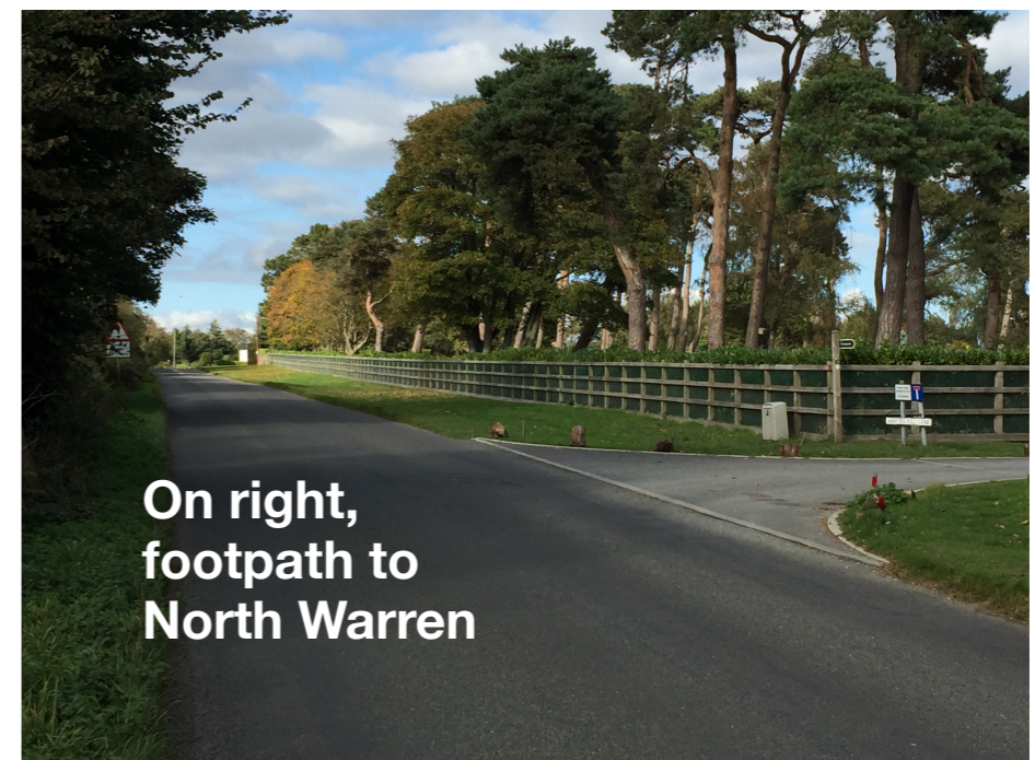
On right, footpath to North Warren